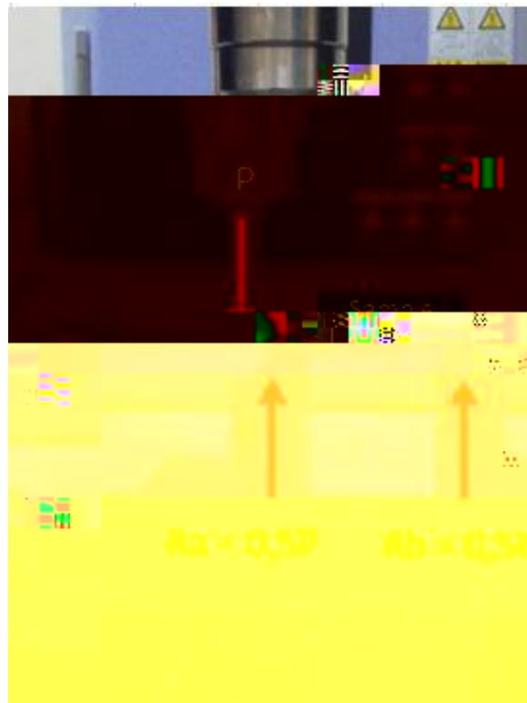
Figure 1. Tensile testing machine with bending apparatus

The testing equipment is a universal testing machine (UTM) (Figure 1). The flexure tests are performed according to ASTM D790 - 15 Test Methods for Flexural Properties of unreinforced and reinforced plastics and electrical insulating materials the method for determining the ability of polymer matrix composite materials to undergo plastic deformation in bending. Applies to the bend test of test pieces taken from composite materials as specified in the relevant standard.